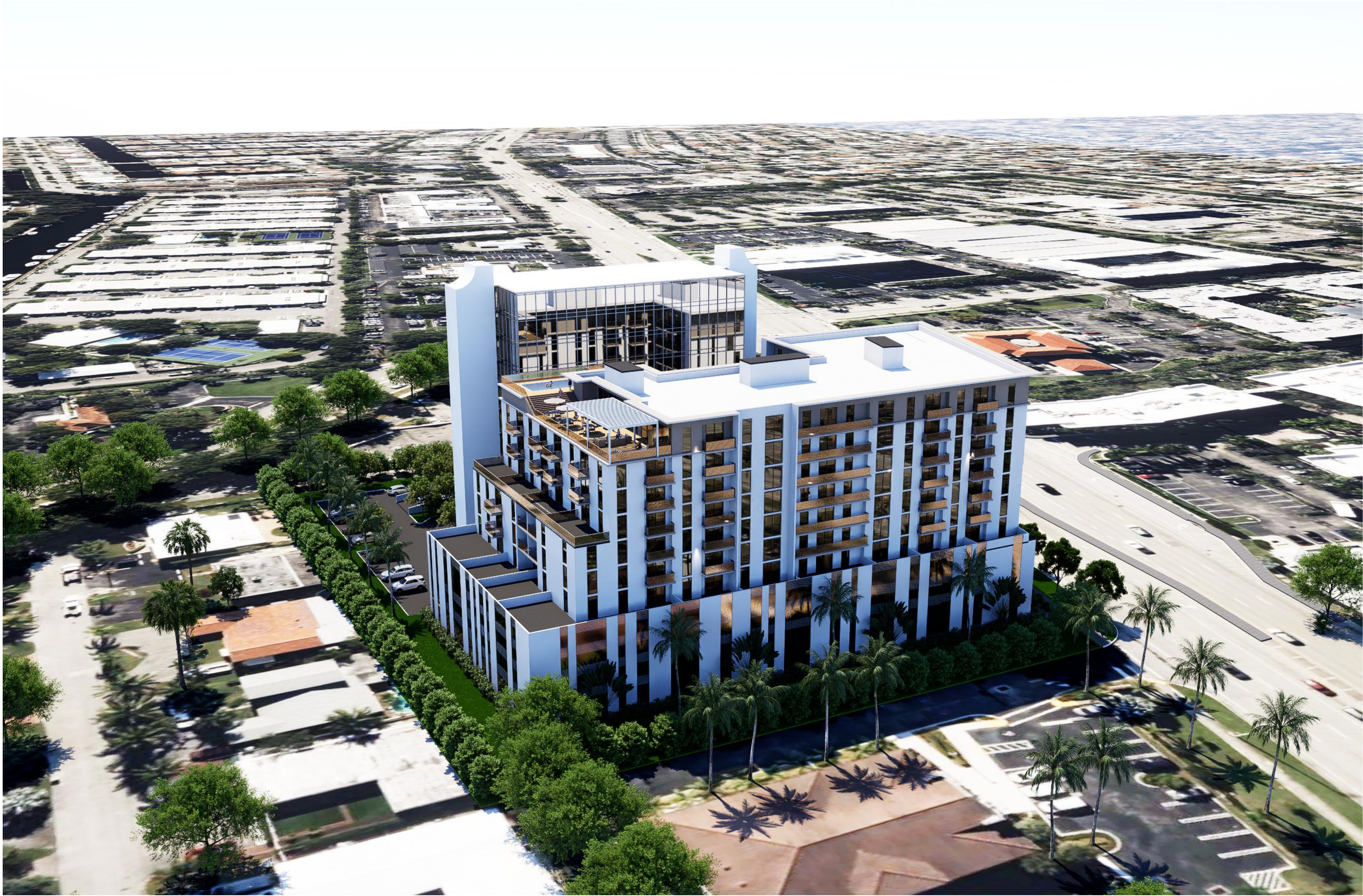
AERIAL VIEW OF THE HEIGHT TRANSITION